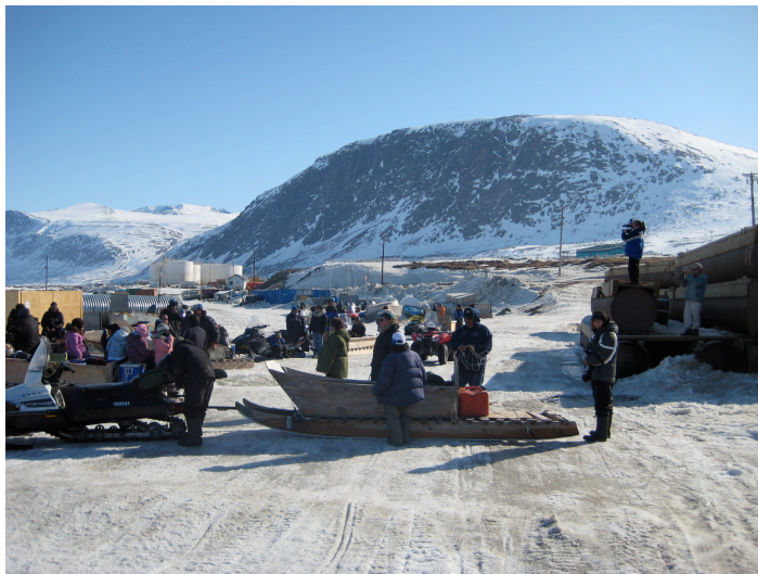
Figure 4.1 Students and staff prepare machines and qamutiks to leave for spring camp (Pangnirtung, Nunavut, May 2010, Gita Ljubicic)