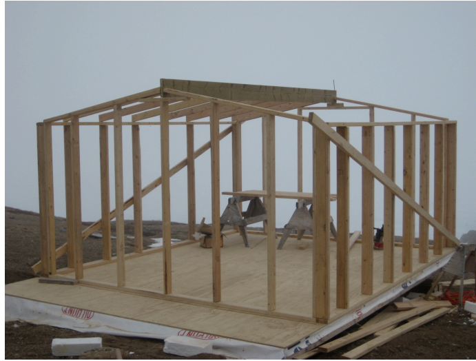
Figure 4.4 Construction of a new cabin at spring camp, Nasauyak Point (Spring Camp, May 2010, Gita Ljubicic)

sources (Lee 2010; Educator 4 2010). The efforts of the school and community in organizing spring camp has resulted in an educational experience with defined goals and expectations. These efforts over the years have enabled the construction of several permanent cabins at Nasauyak Point where the spring camp base is found (Figure 4.4).