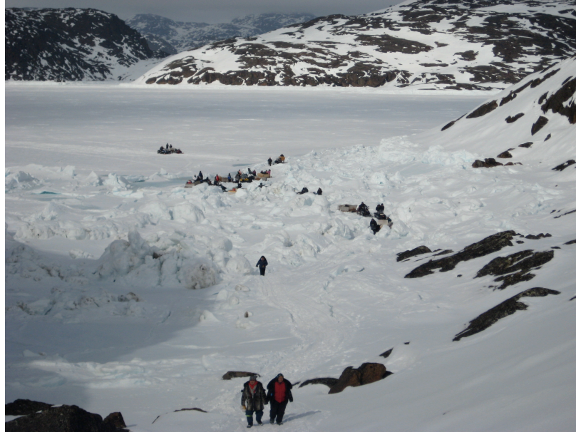
Figure 4.5 Students and staff follow the trail from Lake Avataqtu back to Nasauyak Point (Spring Camp, May 2010, Gita Ljubicic)

As students grow older and graduate they have the opportunity to return to spring camp as adults to be part of the camp staff as guides, cooks, and/or supervisors. They provide role models for the students and demonstrate how they can pursue the learning of traditional knowledge, but also students are learning how the camp is run and are being prepared to survive on the land, know of the dangers, and one day run the camp when the founders have retired. Thus, ensuring that the knowledge shared at camp will not be lost (Alivaktuk 2010; Educator 4 2010).