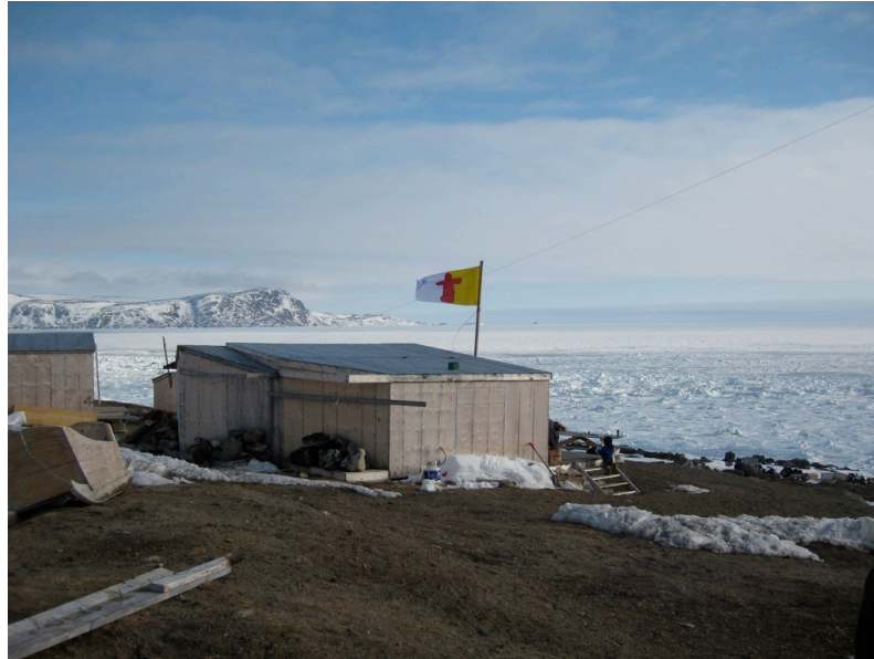
Figure 4.2 Kitchen cabin at Spring Camp, with a view of Cumberland Sound (Spring Camp, May 2010, Carmelle Sullivan)

Students note various differences in what they learn now at camp versus when they were in elementary school. For some students, they used to learn more about fishing but now their learning is more focused on hunting. All the learning at camp is interconnected. For example, when students go fishing, they learn fishing techniques, how to clean and cook the fish, navigational skills in remembering how to get to the lake, and safety skills to understand where the ice is thin, and what to do if they get lost (Attagoyuk Student Group 6 & 7 2010). The various interconnected themes include: safety and survival skills, seal hunting, fishing, navigation, cooking, mechanical skills, and Inuktitut terminology. Table 4.1 provides examples from students which highlight each of these themes.