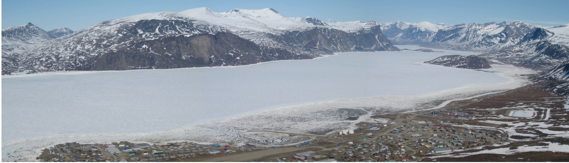
Figure 1.1 View from the south: Pangnirtung Fjord and the community of Pangnirtung (Pangnirtung, May 2010, Carmelle Sullivan)

Pangnirtung has a total population of approximately 1,425 people, (StatsCan 2011) and 94% Inuit (StatsCan 2006). The community is located on the eastern part of Baffin Island, in Pangnirtung Fjord, just off of Cumberland Sound (Figure 1.2). The Turbot fishery is one of the larger economic activities in Pangnirtung, and the community is also home to the Uqqurmiut Centre for Arts & Crafts, known for their impressive weaving and print making. The main office for the Auyuittuq national park is nearby which attracts tourists to the area. Pangnirtung is also part of the decentralized territorial government, with several branches of the GN housed in the community, including a section of the Department of Education.