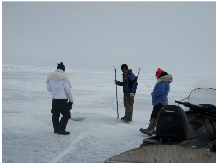
Figure 4.3 Students and camp guide observe a seal hole (Spring Camp, May 2010, Gita Ljubicic)

observe and then experience these skills (i.e. try for themselves) when there is an opportunity (Attagoyuk Student Group 6 & 7 2010) (Figure 4.3). There is also an individual aspect where the onus is on the student to pursue the topic they are interested in learning about by asking questions to those who are knowledgeable and can teach them (Attagoyuk Student Group 2 2010). Nakashuk (2010) also explains how students are made to feel comfortable enough in this learning environment to learn from their mistakes. At spring camp, experiential learning is the main approach to education. For example, one student recalls an experience which occurred at a time when there was a lot of fog and their group got lost so they were driving around for many hours. The students learned through this experience about navigation and following back their trails. Other students have learned that if they get lost they should build an Inuksuk or make a shelter such as an iglu (Attagoyuk Student Group 5 & 6 2010).